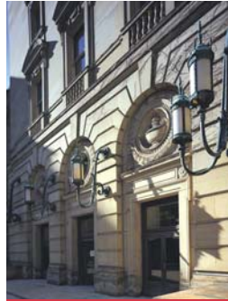
Cleveland Municipal Schools

The Ohio Educational Credit Union is very proud of its financial strength and stability. Throughout our 72-year history, we have reported consistent growth in capital, membership and services. The membership represents several diverse professions, with education being the most significant.