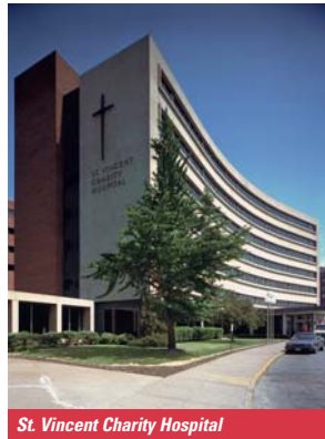
St. Vincent Charity Hospital