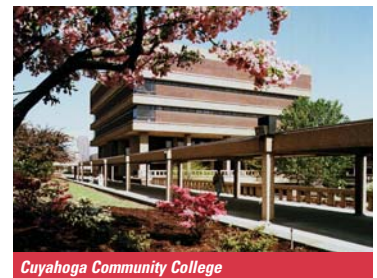
Cuyahoga Community College