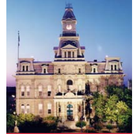
Muskingham County Courthouse