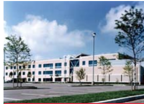
Visiting Nurses Association